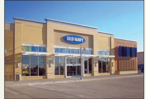
OLD NAVY (THE VILLAGE AT FAIRVIEW) – FAIRVIEW, TX