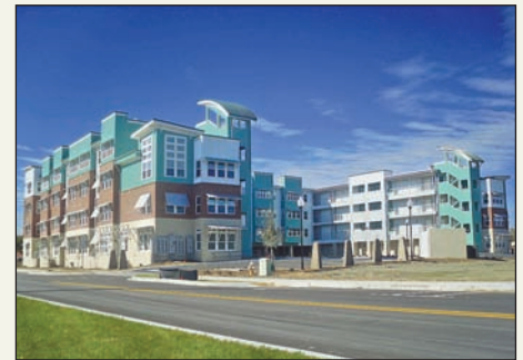
WEST YARD LOFTS – NORTH CHARLESTON, SC

Pictured are recently completed projects by McShane Construction and Cadence McShane that include build-to-suit, design/build and general construction projects for the industrial, office, healthcare, multi-family, mixed-use, retail and educational markets.