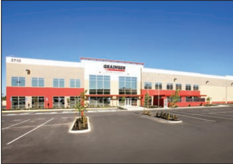
W.W. GRAINGER, INC. – PATTERSON, CA