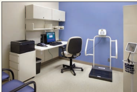
VETERANS AFFAIRS OUTPATIENT CLINIC – TEXAS CITY, TX