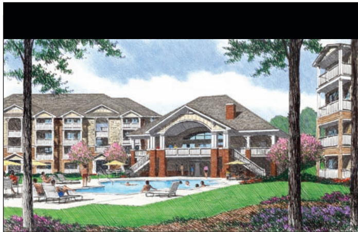
Phillips Development & Realty LLC selected McShane Construction to complete Phillips Mallard Creek, a premier multi-building, 300-unit, luxury apartment development situated on a 30-acre site near the gates of the University of North Carolina in Charlotte, North Carolina.

The Charlotte, North Carolina apartment market continues to outperform expectations currently boasting the 10th best annual rent growth in the U.S. at 8%, as reported by Axiometrics. Those statistics led developer, Phillips Development & Realty LLC, to launch its latest apartment development – Phillips Mallard Creek, a premier 300-unit, Class A apartment project situated near the gates of the University of North Carolina at Charlotte. Phillips recently secured financing through the U.S. Department of Housing and Urban Development's 221(d)(4) program and awarded McShane Construction the assignment to complete this sizable 30-acre development. McShane will construct the 300 apartments of which 50% will be one-bedroom, 37% two-bedrooms and 13% three bedrooms. The development will include amenities such as a social room, coffee café with WIFI, a swimming pool, grilling area, fire pits and a fitness center. As Phillips noted, the rental development will be specifically marketed towards UNC-Charlotte students, staff and faculty, Carolina's Medical Center employees and employees of University Research Park. Ground-breaking is slated for early Fall with initial unit turnover in July 2012 and final project completion in May 2013. The Preston Partnership is providing the architectural services for this luxury rental development. □