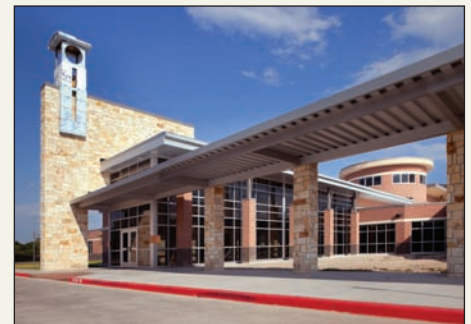
EDGEWOOD ELEMENTARY SCHOOL – HOUSTON, TX