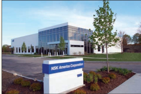
NSK AMERICA CORPORATION – HOFFMAN ESTATES, IL