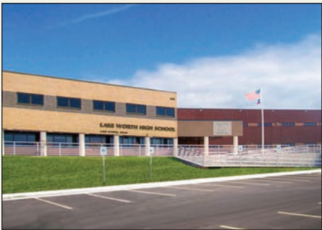
LAKE WORTH HIGH SCHOOL – LAKE WORTH, TX