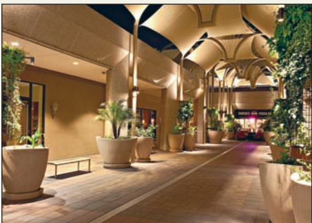
CAMELBACK ESPLANADE – PHOENIX, AZ